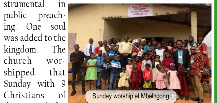
Sunday worship at Mbalngong