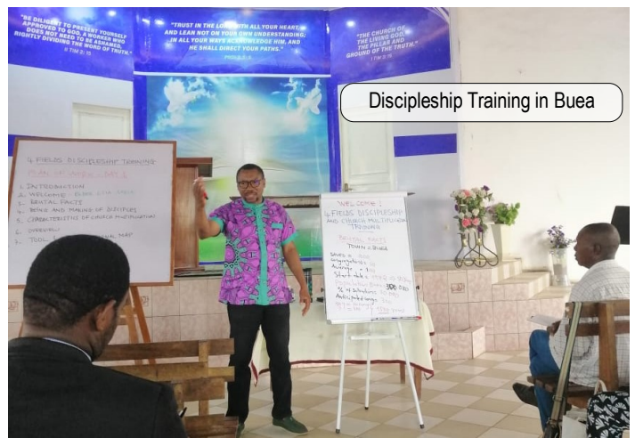
Discipleship Training in Buea

leaders have been trained in the French-speaking part of the country, 12 preachers and 10 student-preachers from English speaking area where the trainings just began. An average of ten tools are always treated. Some tools like Iron on iron, 5 levels of leadership and the MAWL principle are left out to be treated during follow-up sessions. Prayers are that the trainees go to work so that they start bearing fruits soon.