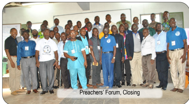
Preachers' Forum, Closing

50 participants (4 elders, 34 preachers and 16 church leaders) and the commitment to their calling made the forum in Bonaberi a great success. They were rep-