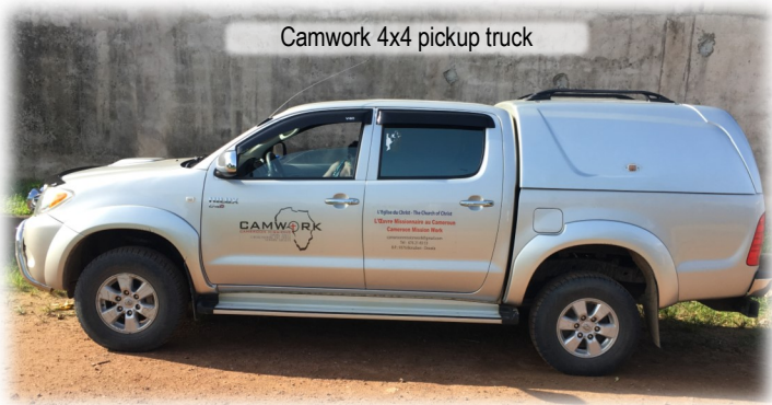
Camwork 4x4 pickup truck