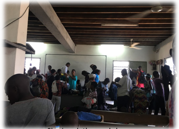
Sharing clothes and shoes with brethren and the community

ing of items contained in their container with churches and individuals. This effort is largely spearheaded by the Laurel church of Christ