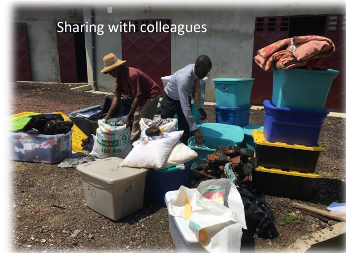
Sharing with colleagues

Two other great blessings last month were the conversion of Malovine and the shar-