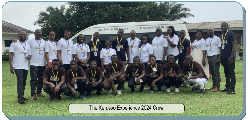
The Kerusso Experience 2024 Crew

Cameroon greetings and blessings to the Family of God! Hope those reading from the USA have all enjoyed a happy Thanksgiving! This report covers the last few months work and highlights the 3 major pillars of Camwork. So much has taken place, please take a glance :)