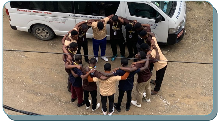
2024 Kerusso Students' farewell moment