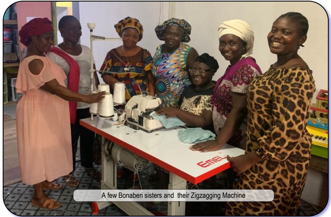
A few Bonaberi sisters and their Zigzagging Machine

On the 7th of November 2023, Camwork rejoiced over the grant approval of $4500 by the International Healthcare Foundation –IHCF/African Christian Hospitals for the purchase of a zigzagging machine, a capital to help the Reusable Sanitary Pad (RSP) project to be self-sustaining and carrying out health outreaches. The feedback is positive and the glory goes to God.