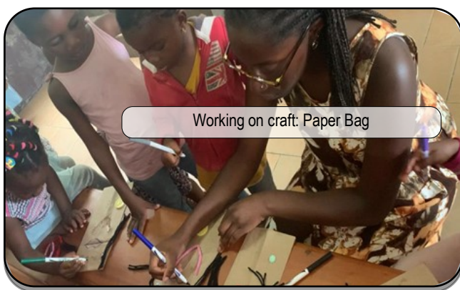
Working on craft: Paper Bag