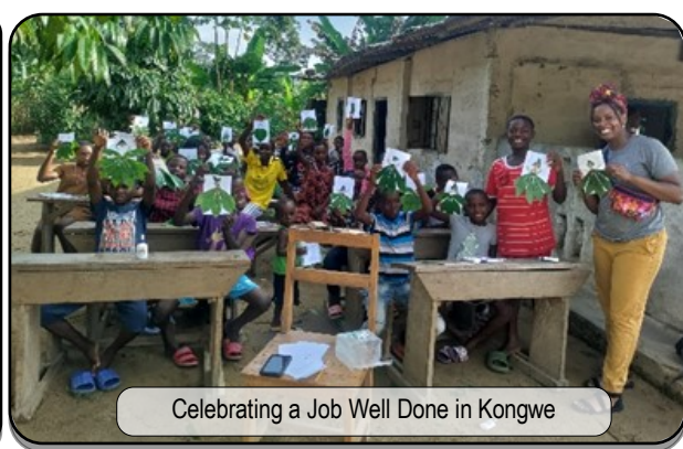
Celebrating a Job Well Done in Kongwe