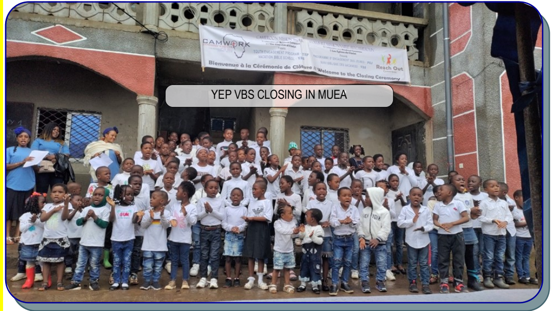
YEP VBS CLOSING IN MUEA

Y outh Engagement Program (YEP) / Vacation Bible School (VBS) is organized by Cameroon Mission Work (CAMWORK) in collaboration with the Churches of Christ and Reachout Cameroon. It is a one-month program for kids aged 5 to 15 every summer. This year, it was organized in 8 locations: June 26th to July 22nd in Bonaberi, Cité de la Paix, Kongwe, Mudeka, Tiko, Buea and Muea, and August 1st to 27th in Bangangte. A total of 779 kids attended. The theme was "I AM INCREDIBLE, I AM SPECIAL" from Psalms 139:14.