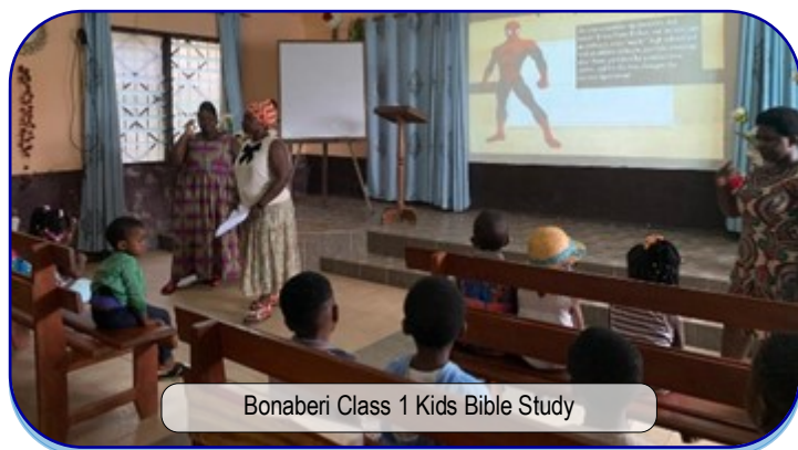
Bonaberi Class 1 Kids Bible Study