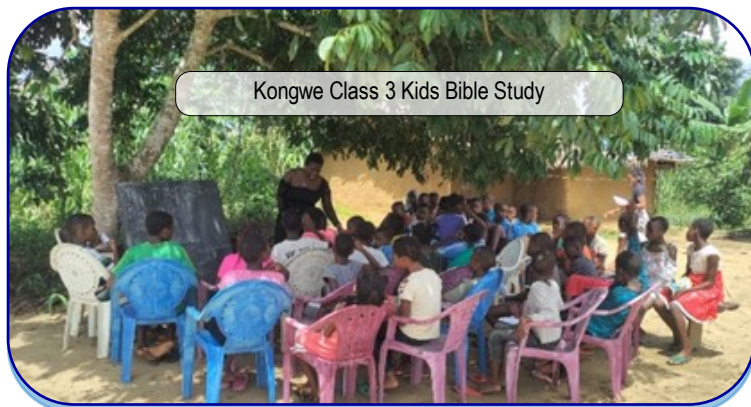
Kongwe Class 3 Kids Bible Study

Activities included: Bible Studies, Arts and Crafts, Singing, Cooking, Sex Education and Personal Hygiene, Environmental Education, Children's Rights, Games, Memory Verses, and Skits. Every activity was centered on the theme.